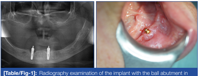
position 43 (FDI classification). [Table/Fig-2]: Intraoral view of the ball abutment of the implant in position 43 (FDI classification). (Images from left to right)

After the intraoral examination OPG (Kodak 9000 3D, Carestream/ Trophy, Marne-la-Vallée, France) was done and evaluated In OPG examination it was found that there was bone loss of 4 mm and 2 mm in height around right and left implant in mandible, respectively [Table/Fig-1,2].